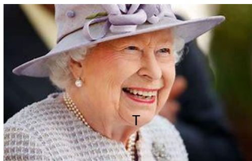
Queen Elizabeth II

Her son Charles, now King Charles III, succeeded her as the country's monarch, he was formerly known as The Prince of Wales.