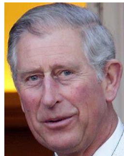
King Charles III