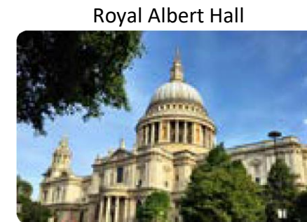
Royal Albert Hall