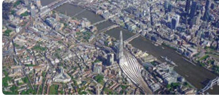
Aerial view of a city

A city is a large, busy settlement where lots of people live and work. A city usually has a cathedral, a river, important buildings and offices where people work. There are lots of things to see and do in a city. There are many shops and restaurants to visit.