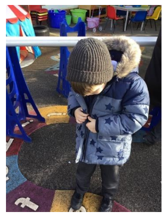
Mastering zips and buttons