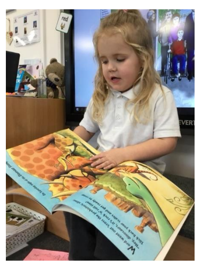
Exploring new stories