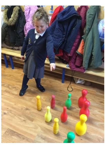
Counting skills during a game