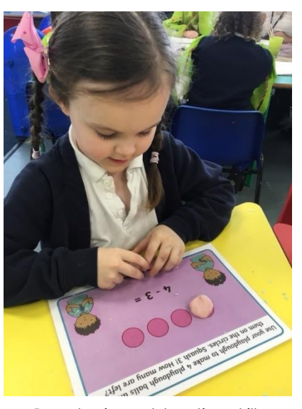
Developing subtraction skills