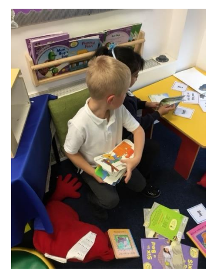
Reading in the box corner with friends

Literacy is one of the four specific areas of learning. In literacy the children develop their early reading and writing skills.