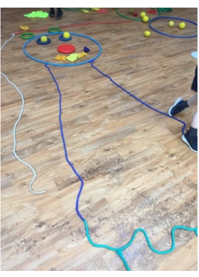
Creating art in our PE lessons