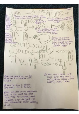
Retelling stories using story maps