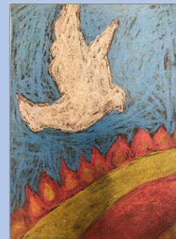
A picture representing Pentecost by Olanna

We celebrate the birth of the church this Sunday. Happy Pentecost Day everyone.