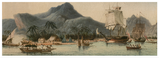
HMS Resolution and HMS Discovery

In 1776, Captain Cook went on his final voyage. He sailed on the HMS Resolution again and the HMS Discovery travelled with him. He was looking for a route between the Atlantic and Pacific Oceans. He visited the Hawaiian Islands, where he was killed.