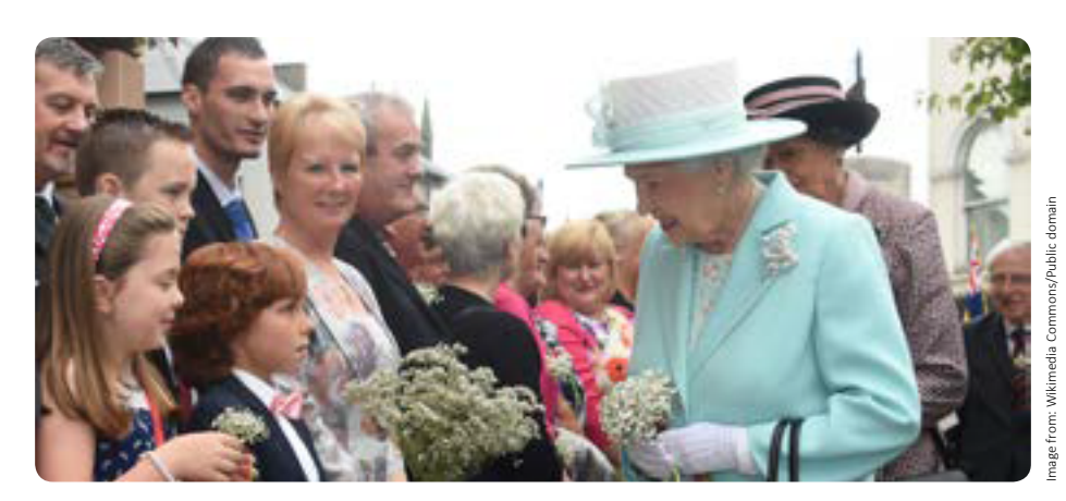
The Queen meets lots of people

Elizabeth II is the monarch of the United Kingdom. She was born in 1926 and became queen in 1952. She was married to Prince Philip and has a large family. She lives in Buckingham Palace in London. The Queen is very important. She visits charities and schools in the United Kingdom and welcomes world leaders to Buckingham Palace.