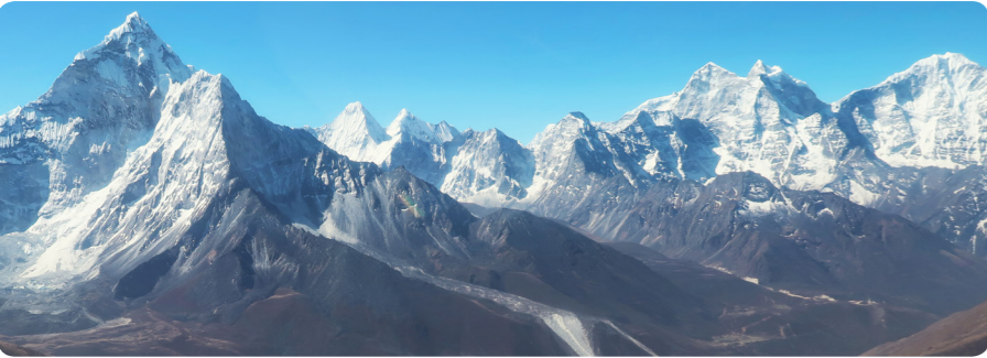
Himalayas mountain range

A mountain is a large, raised part of the Earth’s surface. A mountain’s highest point is called its peak or summit. Mountains are at least 610m in height. A mountain range is a chain of mountains that are close together. They are usually arranged in a line connected by ridges.