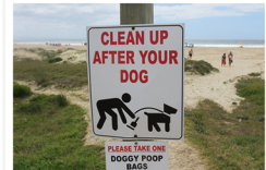
'Clean up after your dog' sign