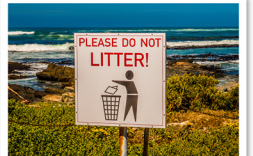
'No littering' sign

A community is made up of the people who live there. People in a community may have some similarities and differences but all people should be treated with kindness, compassion and respect. It is also important to look after the environment in a community. Removing litter and planting new bulbs are great ways to keep the community a nice place to live.